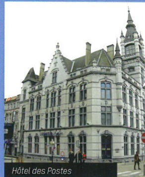
Hôtel des Postes