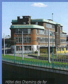
Hôtel des Chemins de fer