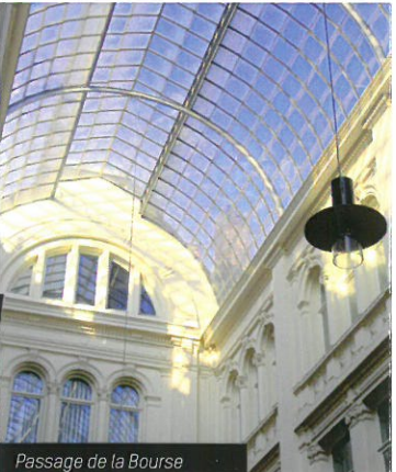
Passage de la Bourse