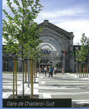
Gare de Charleroi-Sud